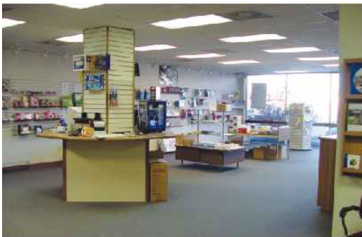
Spacious Open and Attractive Showroom