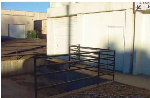
Single Dock-High Loading Area