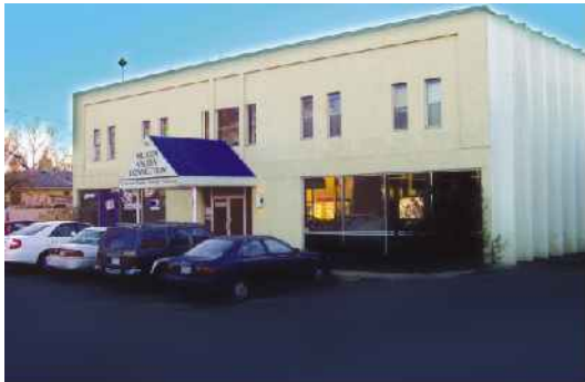
Excellent access from North Circle Drive